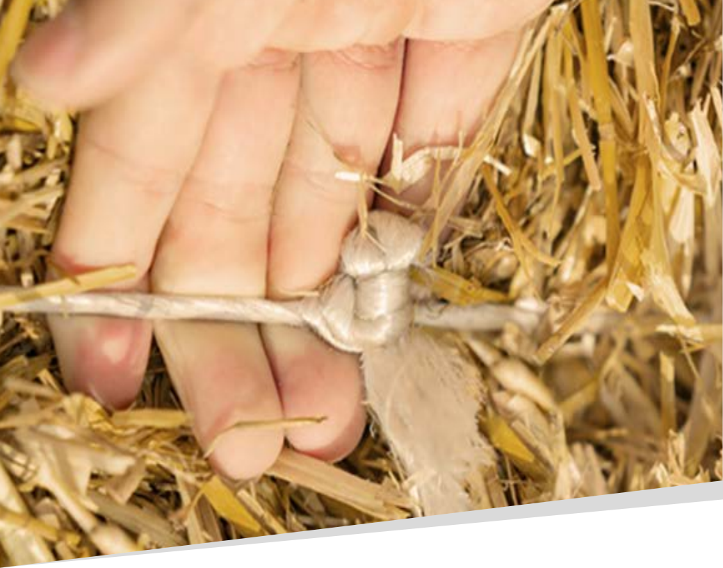
DEERING KNOT (STANDARD)